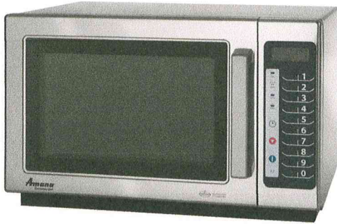
Model RCS10TS shown